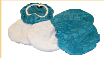
M-15 Micro-Fiber Bonnet

Replaces one of the foam layers with a firmer material for more aggressive work. Both pads available in Hook & Loop