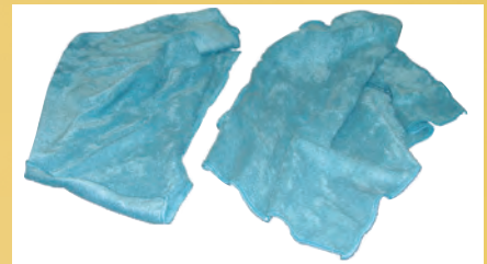
MF-T Micro-Fiber Towel

Great all purpose shop towel for wiping up dust. 16" x 16"